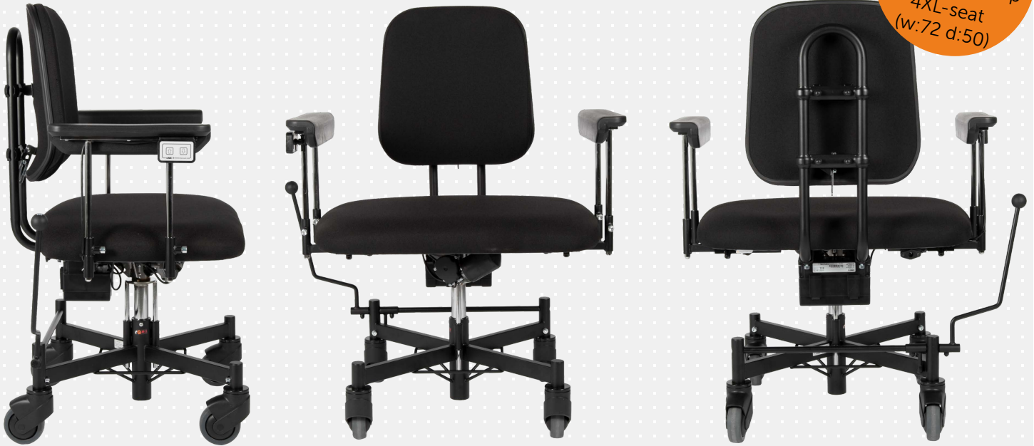
VELA Tango 310E

NEW Up to 300 kg Elec. aid to get up 4XL-seat (w:72 d:50)