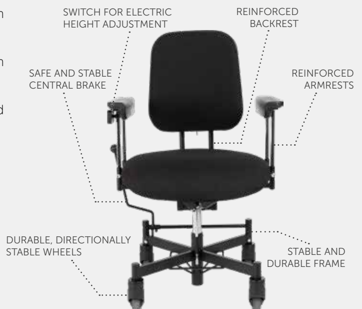
VELA Tango 310E features