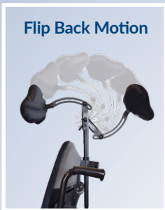
Flip Back Motion