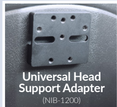
Universal Head Support Adapter (NIB-1200)